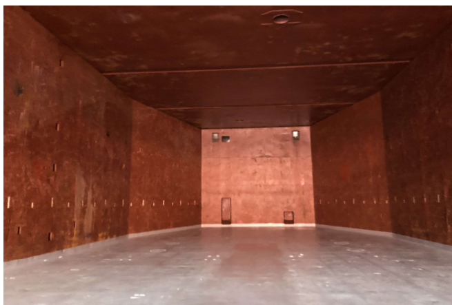
Hold looking forward Showing narrowing over 8.1 m to 8 m

Dangerous goods fitted Grain Fitted Heavy cargo fitted El Vent